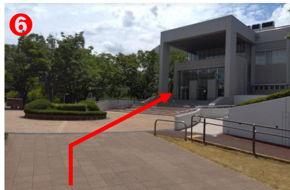
Entrance of FIT Arena