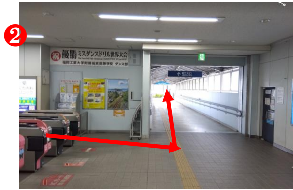
Gate in Station